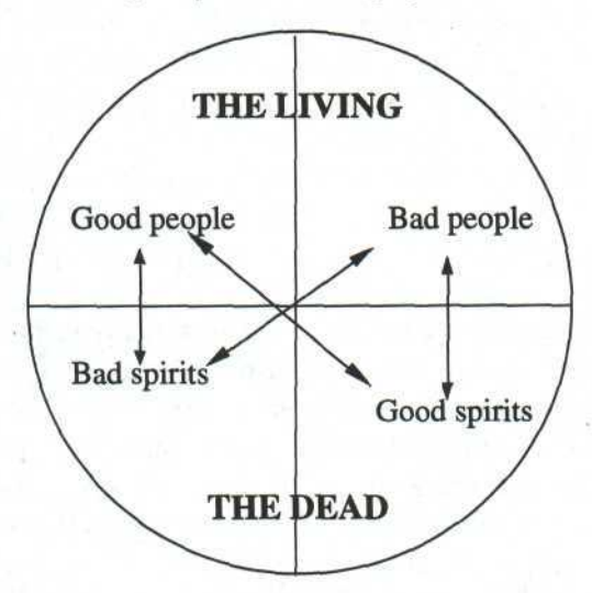
Figure 1: Graphic view of the foundations of Afriethics

The living-dead are in a continuum. At one end are the very good people and at the other end are very bad people. In between are good people and bad people. Because African society is communal, there is constant interaction between the good people and the not-so-good. The aim is to have the good acts of the good people rub-off on the not-so-good so that they too can emulate them and also become good.