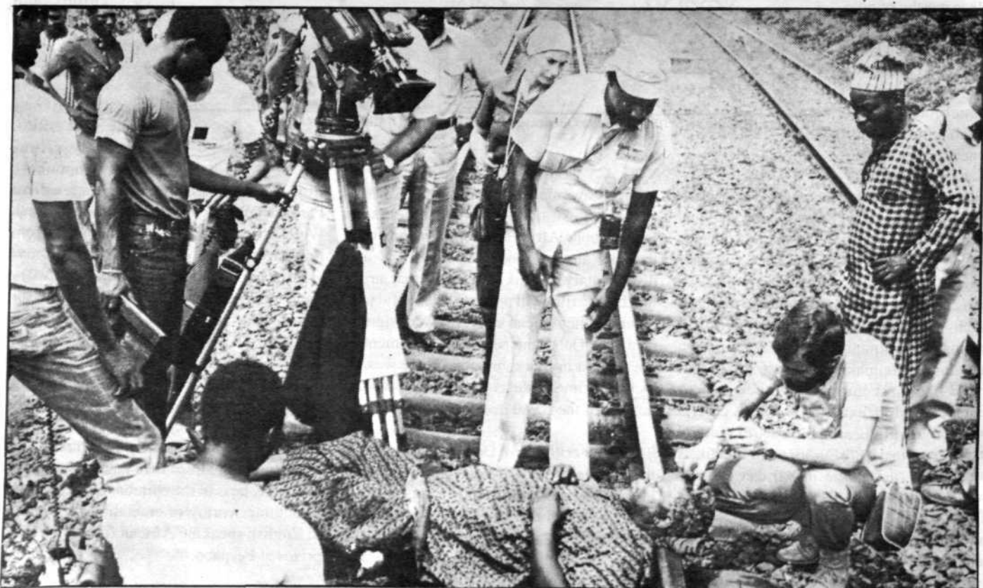
On the location of the film Orun Mooru

These are: the Nigerian Enterprise Promo-