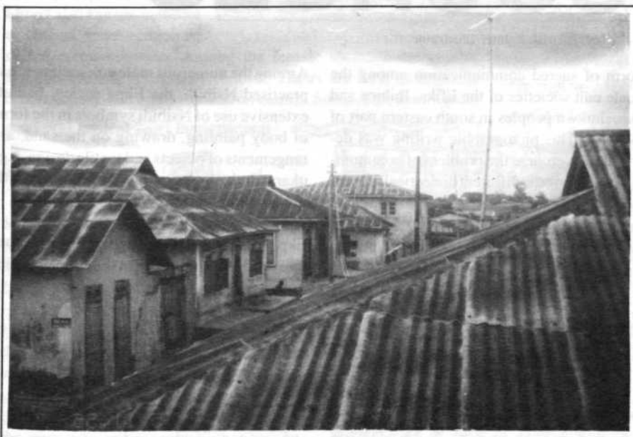
Left: The neighbourhood as seen through Tutuola's window in Ibadan

And the only way this can be done is by contributing our financial and moral quota to the effort. It is a chance in a million to show our contributions to world culture in a true light. GR