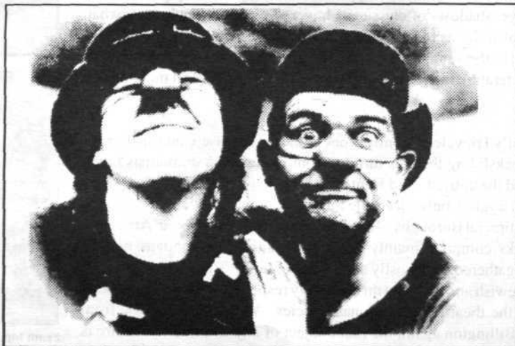
Comedy for youths at the Tricycle Theatre, Summer, 1994

The procession of buildings, seen through the window on Coldharbour Lane were indeed sufficiently 'English'. Would it be correct then to say that the very little indigenous English population down on the High Street was only an example of English ingestion? But enough. Ingestion or digestion, at this stage, I'm afraid, I also have to banish you all!! GR