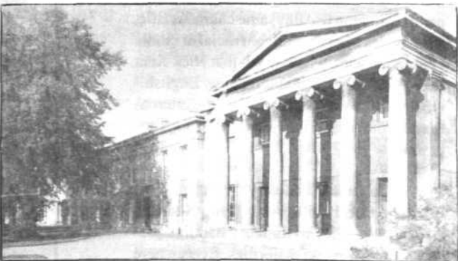
From top, Williams Shakespeare's birthplace at Stratford-upon-Avon. The Royal Shakespeare Theatre, Stratford-upon-Avon Downing College, Cambridge