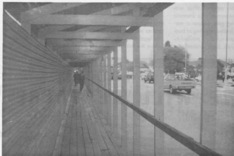
Harare high street

The workshop exposed the editors to common journal killers which are often very dangerous for the very reason that they are prone to being taken for granted. Even minuscule factors like the way the name of a journal reads on the cover, the publication's size and format also, (in addition to consistency of format) which many were surprised to learn help librarians to determine what publications to select for subscription. The booby-traps in the roadways to a successful publication of journals (especially in Africa) were so varied and could never have come naturally to anyone without the practical, long-standing experience of the coordinator, Hans Zell and his humorous compliment, Roger Stringer who besides being workshop co-instructor, also contributes a chapter in the