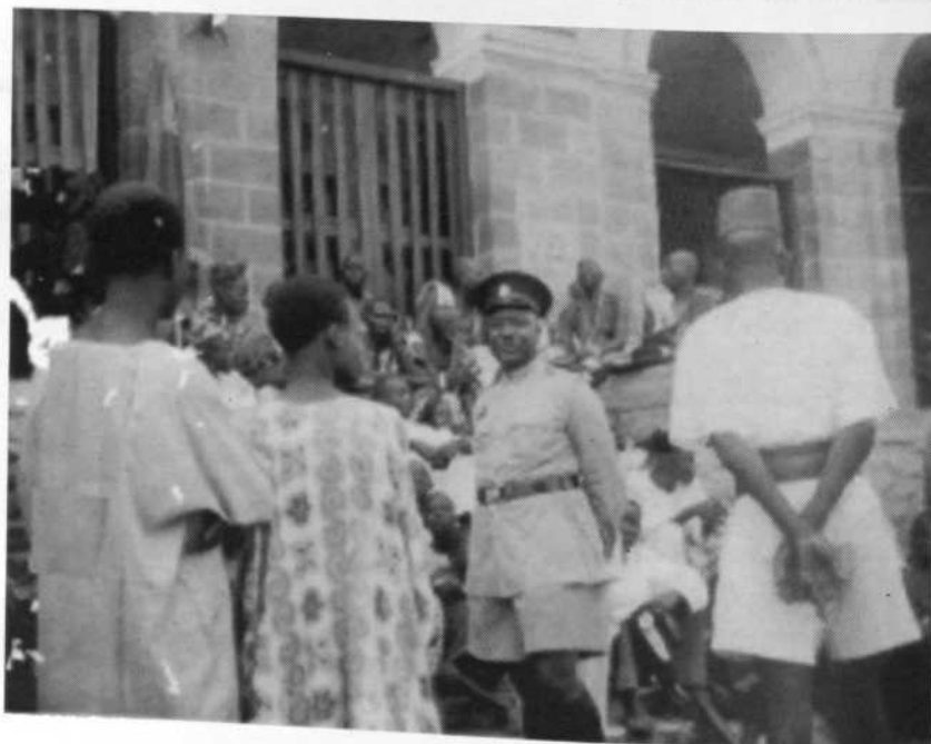
Loyalists to the ousted Alake of Egbaland, Oba Ademola, mainly palace guards and chiefs keep vigil just before the king's successful ouster.