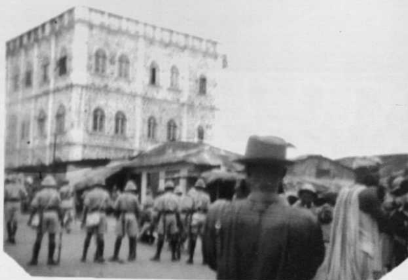
Police and palace guards rehearsing in Abeokuta to keep the peace at the height of the women's uprising.