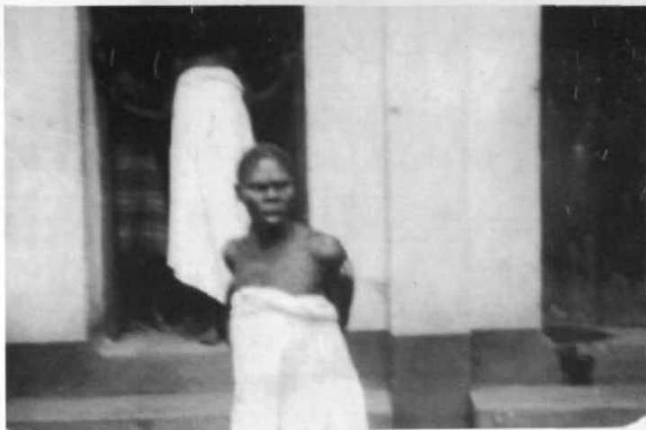
BELOW (left and right): Incarcerated women from orile Oko in Ile-Ife prison. These pictures are dated February 13 1949.