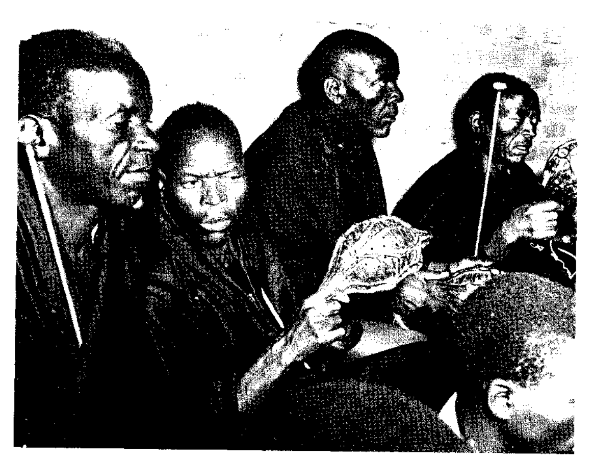
Fig. 2. Musicians playing at a ceremony held for the tribal mediums in the Rusape district