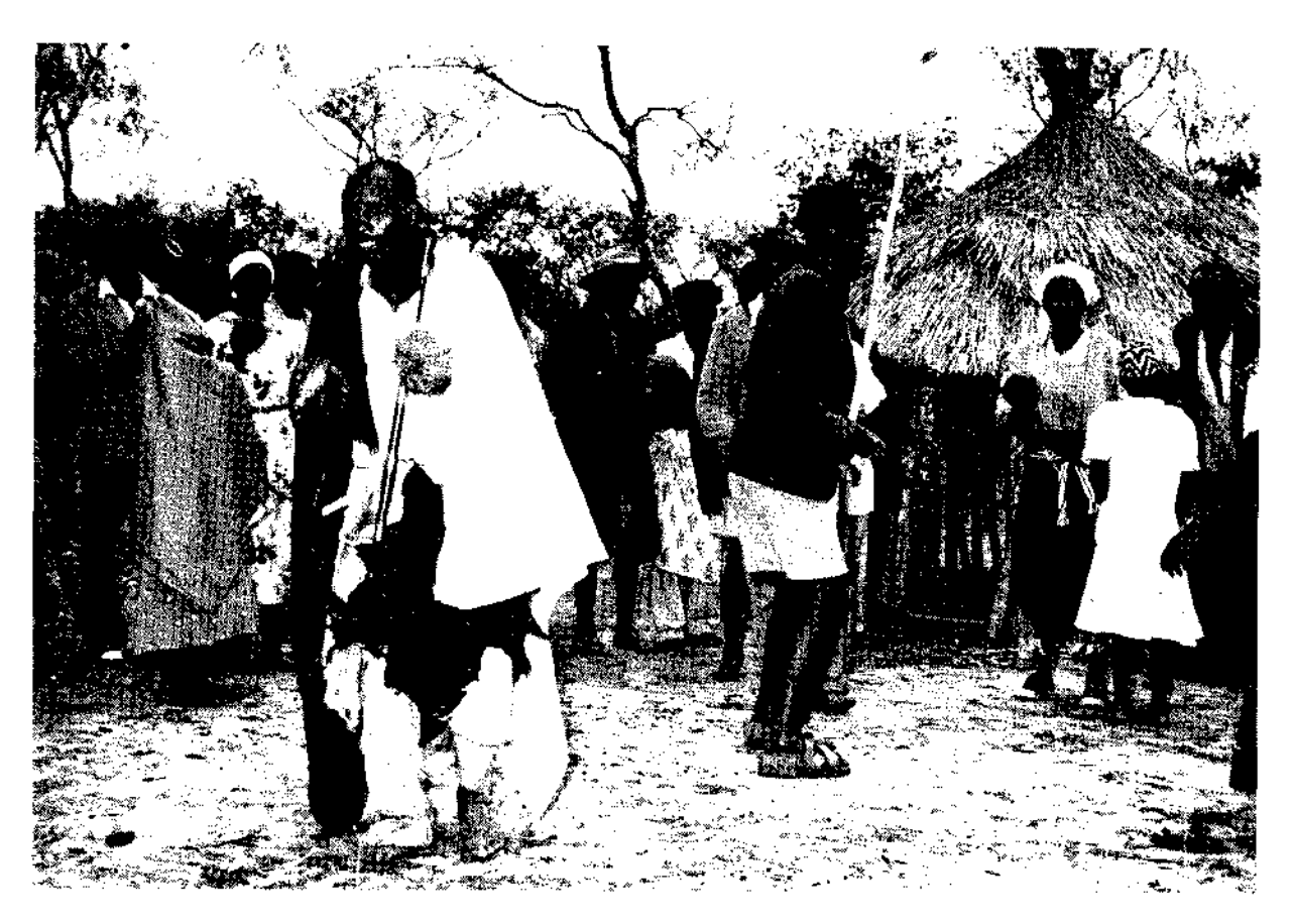
Fig. 9. A tribal medium possessed and in a state of ecstasy dancing outside the sanctuary.