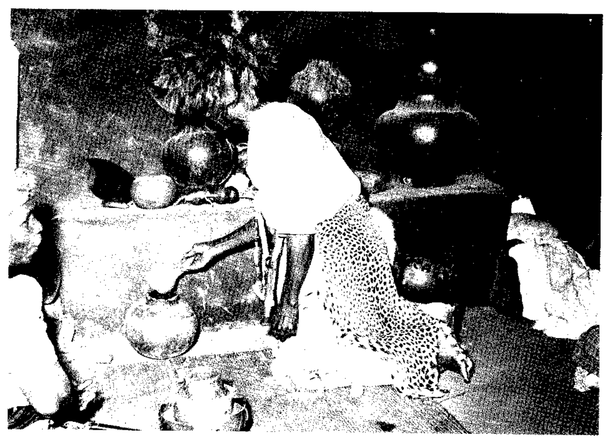
Fig. 5. An nganga praying before the rukuva (potshelf and offering beer to his ancestral spirits).