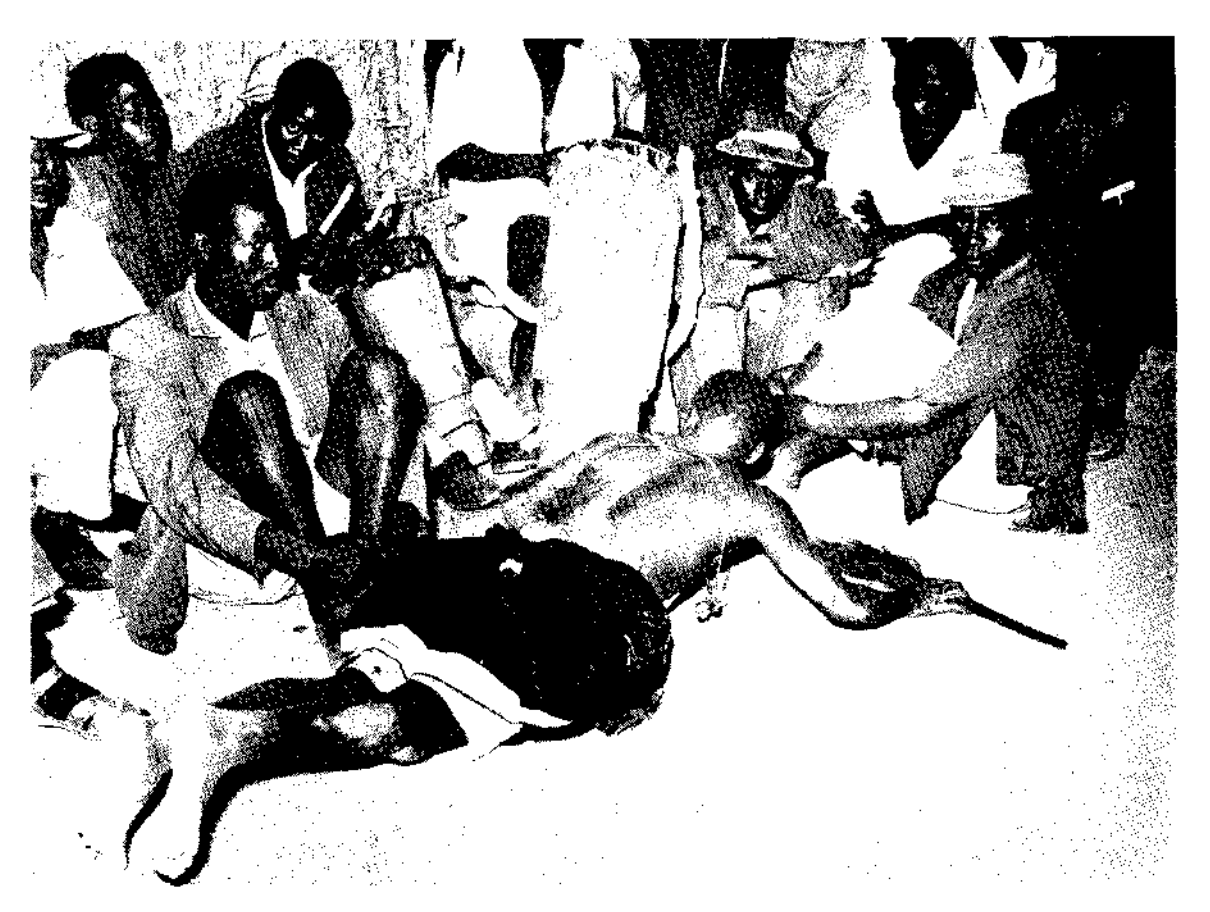
Fig. 6. A Baboon shave ceremony (bveni shave). Note the medium appropriately clothed has fallen on the ground before the musicians