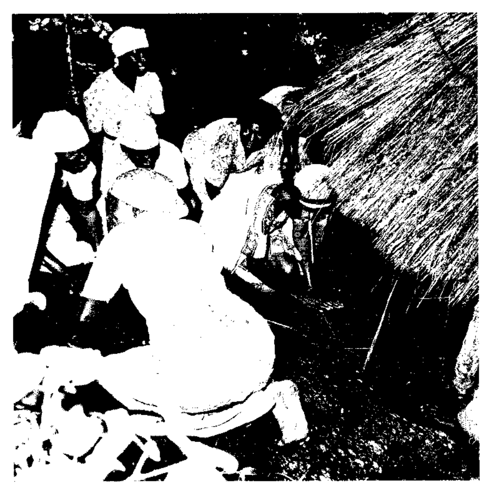
Fig. 10. Woman in a crouched position beating the ground in honour of the tribal spirit before the sanctuary (dendemoro)