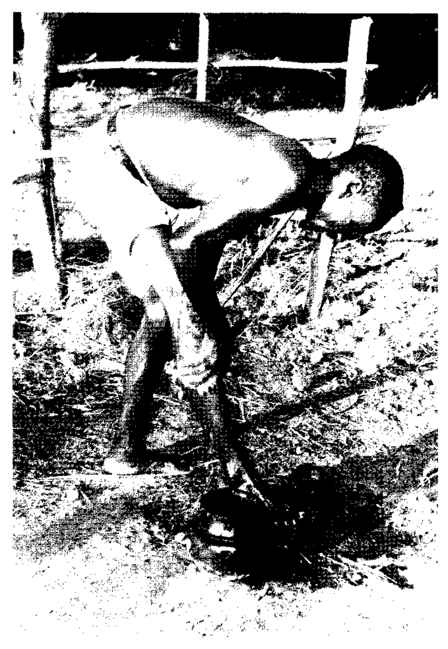
Fig. 7. After the shave medium has become depossessed he washes himself down with water.