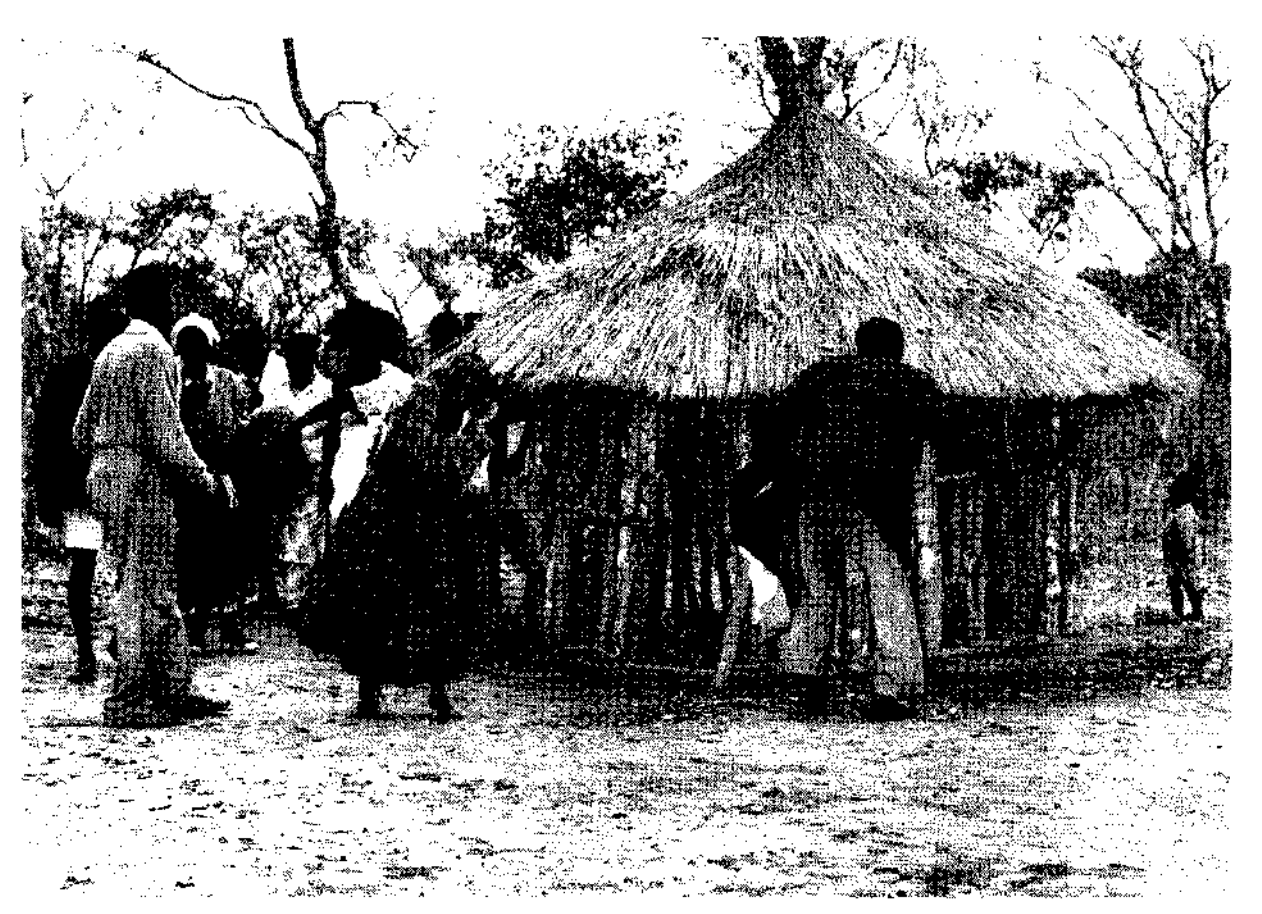
Fig. 14. A ritual service at Mrewa. Consecrated beer is placed in the sanctuary for the mhondoro, People gather round the sanctuary for the ceremony. Note the elation of the woman in the foreground.