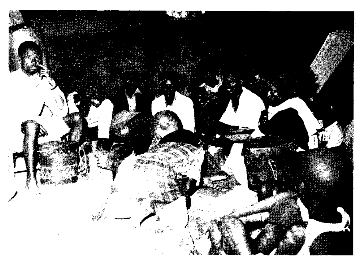
Fig. 8. Musicians playing at annual ceremony, at which the witchdoctor thanks his healing spirit. Note the woman kneeling fully before the musicians