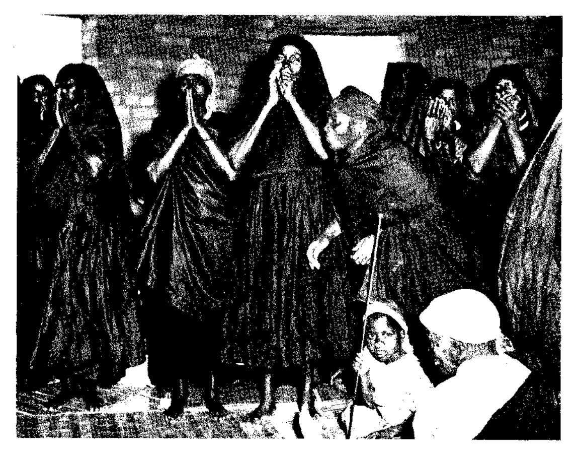
Fig. 13. Woman utulating at a ceremony for the tribal spirits in the Rusawe district. An expression of excitement and pleasure can be seen on the face of the woman in the right foreground.