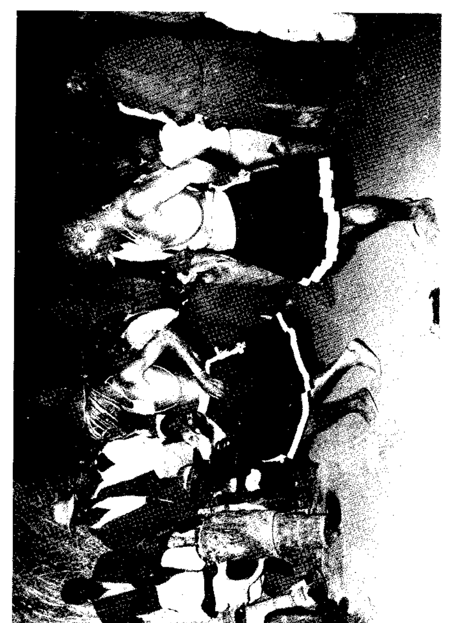
Fig. 3. Two mediums of bveni shave dancing with the orchestra.