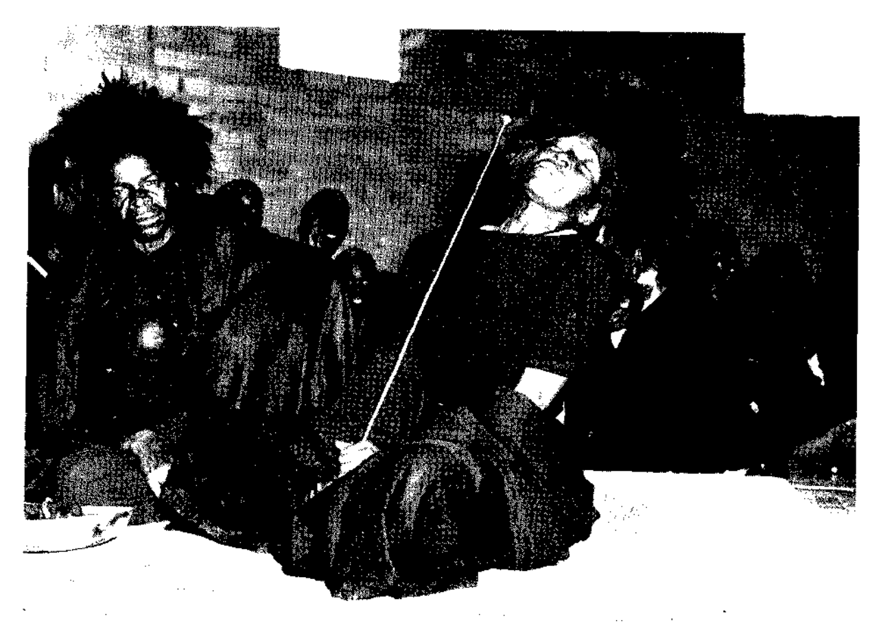
Fig. 4. A female medium possessed by the mhondoro spirit. Note the tightened neck muscles