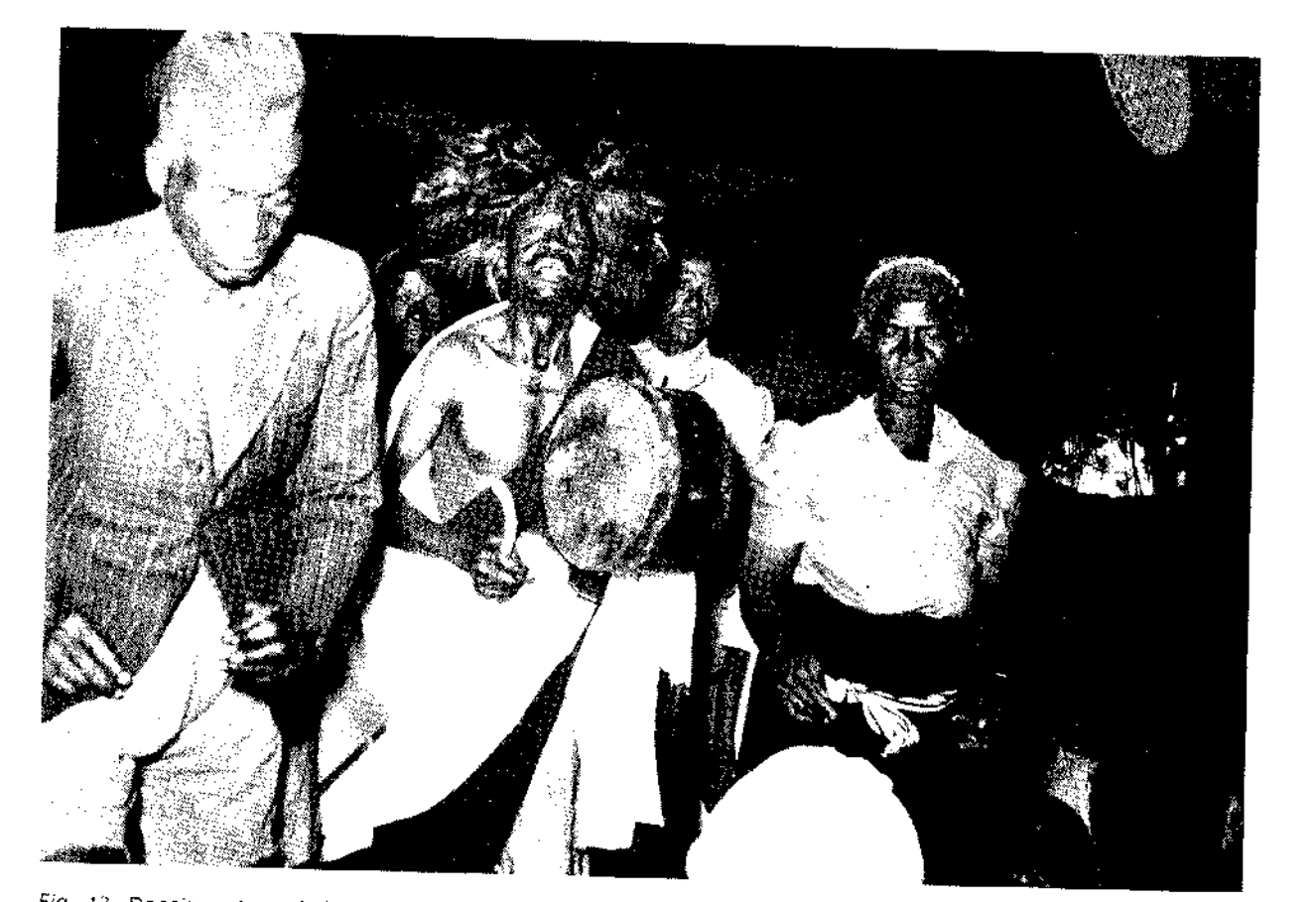
Fig. 12. Dancing at a witchdoctor's annual party. Note the excitement on the face of the witchdoctor who is beating his drum.