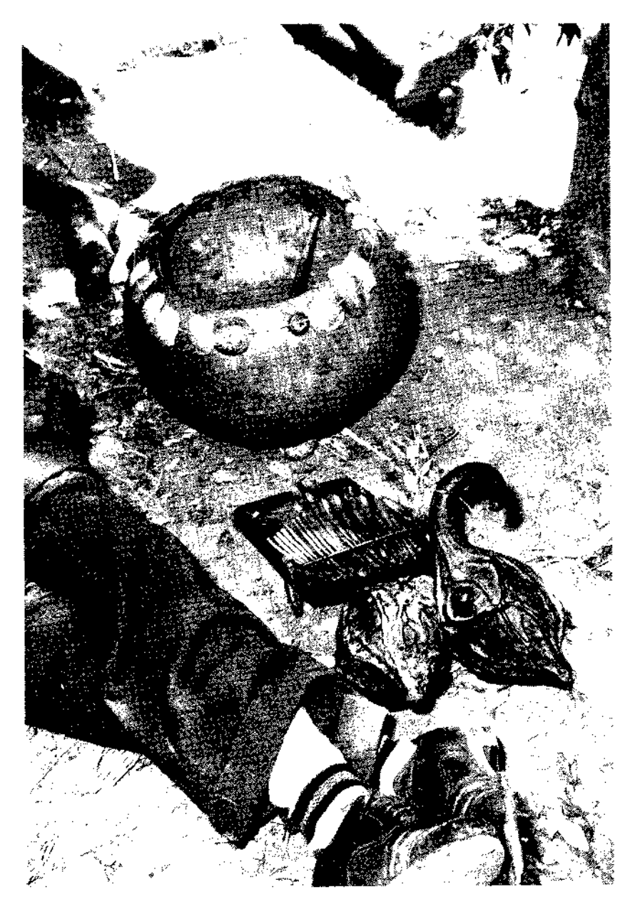
Fig. 1. The musical instruments commonly employed at a ceremony held for a mhondorg.