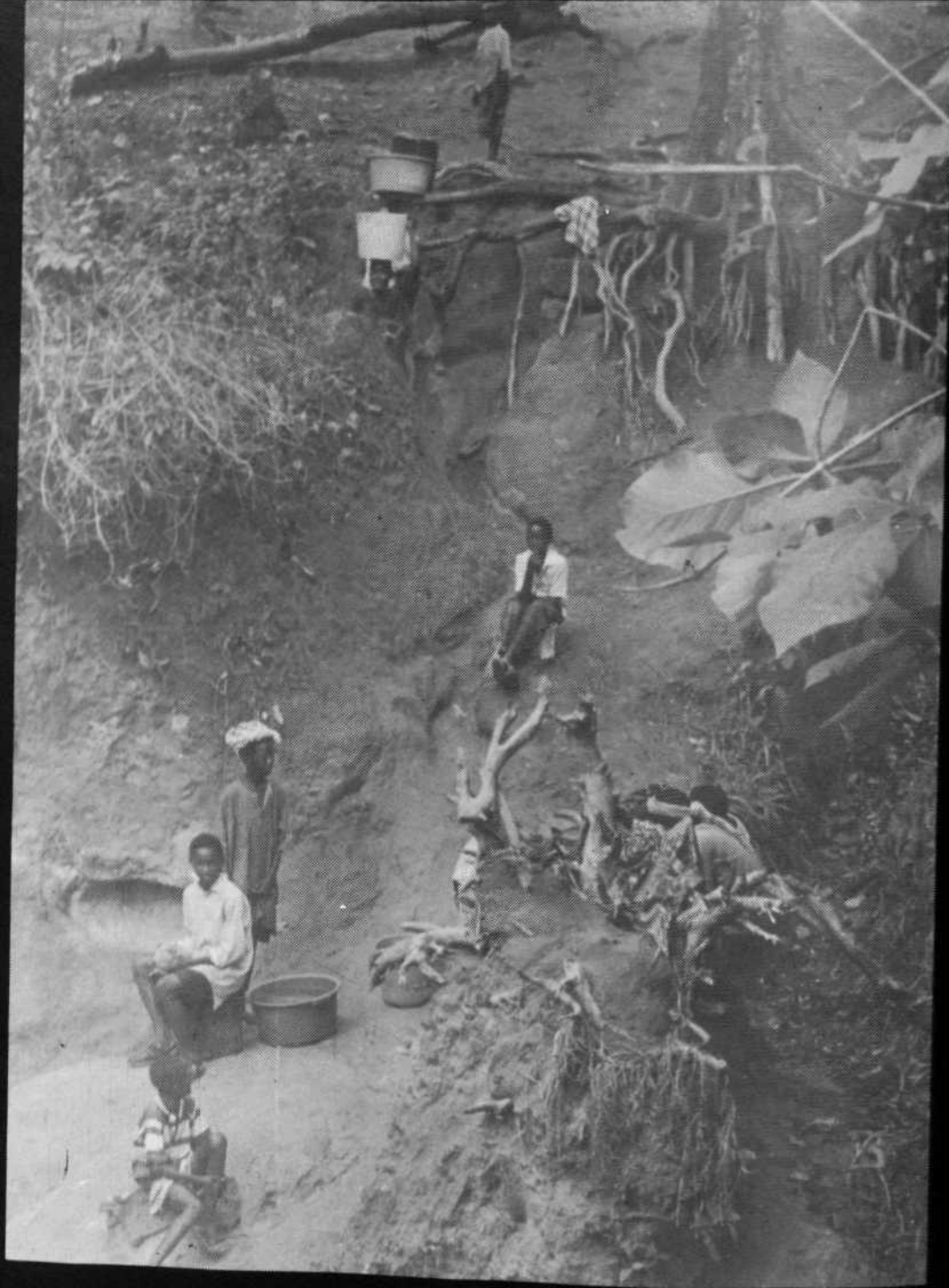
Trail of Water